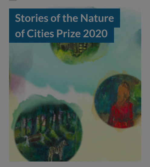
POSTED ON 23 DEC 2022