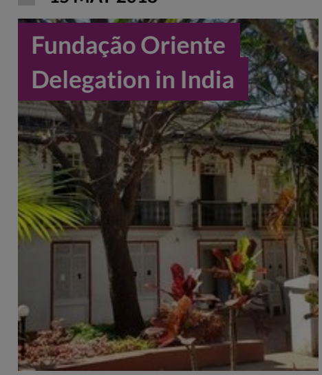
POSTED ON 15 MAY 2018