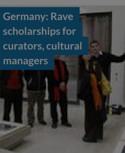
POSTED ON 14 JUN 2010