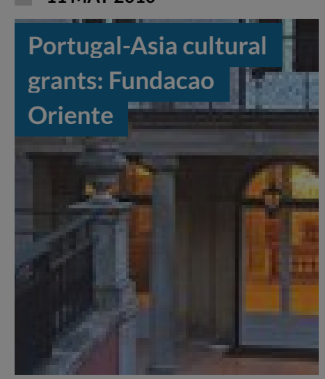
POSTED ON 11 MAY 2010