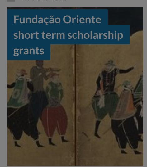
POSTED ON 10 JUN 2015