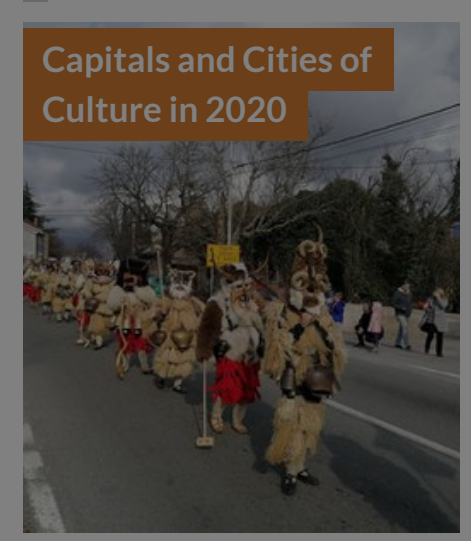
POSTED ON 11 FEB 2018