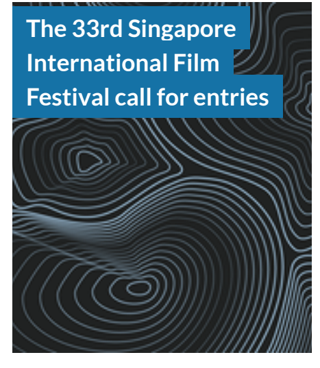
POSTED ON 02 OCT 2013