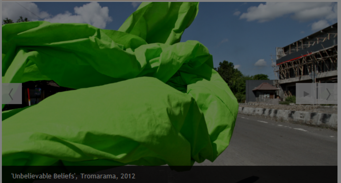
'Unbelievable Beliefs', Tromarama, 2012