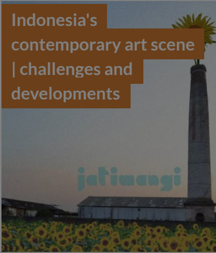
Indonesia's contemporary art scene | challenges and developments