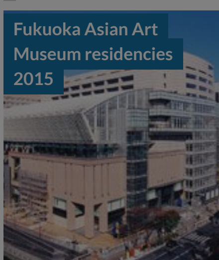
POSTED ON 22 DEC 2022