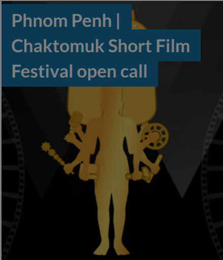
Phnom Penh | Chaktomuk Short Film Festival open call