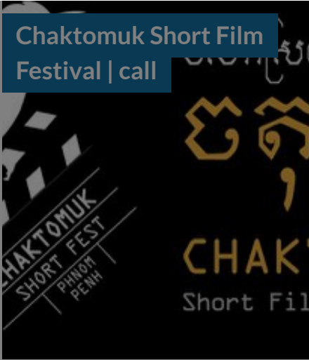
Chaktomuk Short Film Festival | call