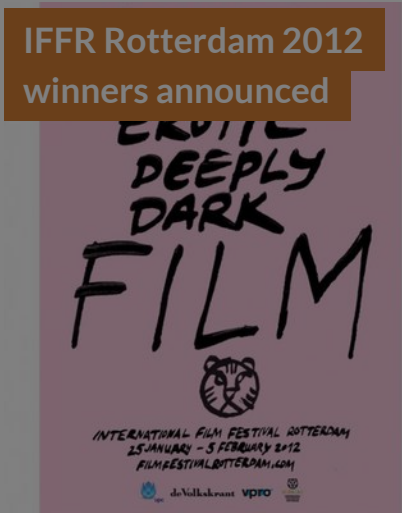
IFFR Rotterdam 2012 winners announced