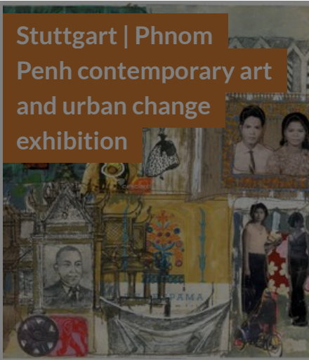
Stuttgart | Phnom Penh contemporary art and urban change exhibition