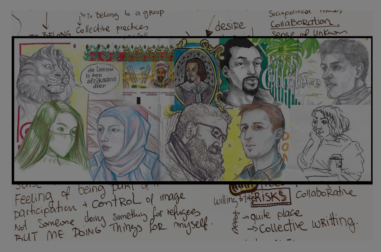
The Post Collective was <u>one of the residents</u> hosted by Kunsthal Gent in Belgium during spring 2020. In response to the pandemic, Kunsthal Gent extended their residency to support them in difficult times.