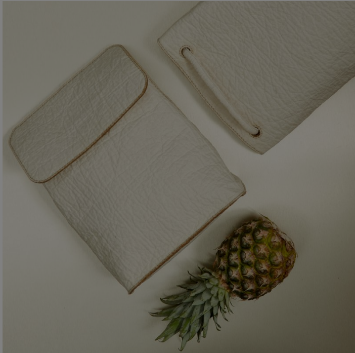
Ananas Anam/Pinatex - Designed and made by

[caption id="attachment_61761" align="alignleft" width="348"]