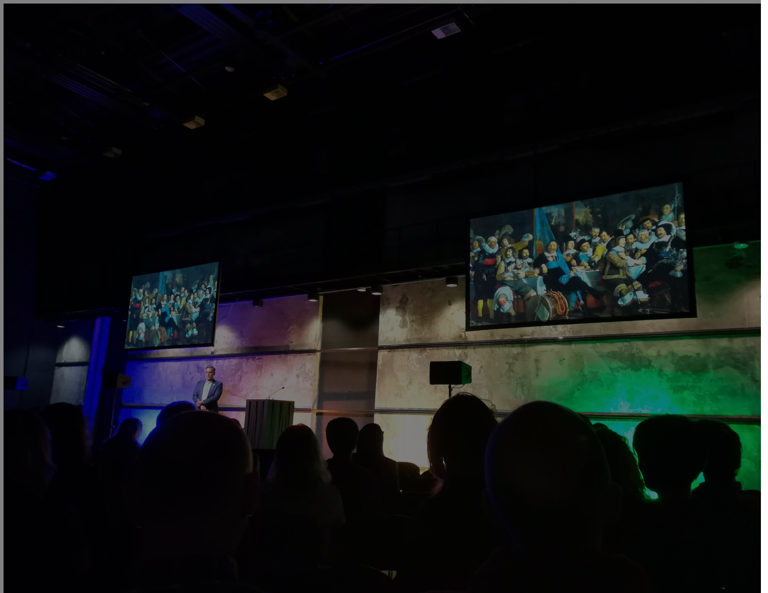
10 th ICCPR in University of Tallinn, Estonia