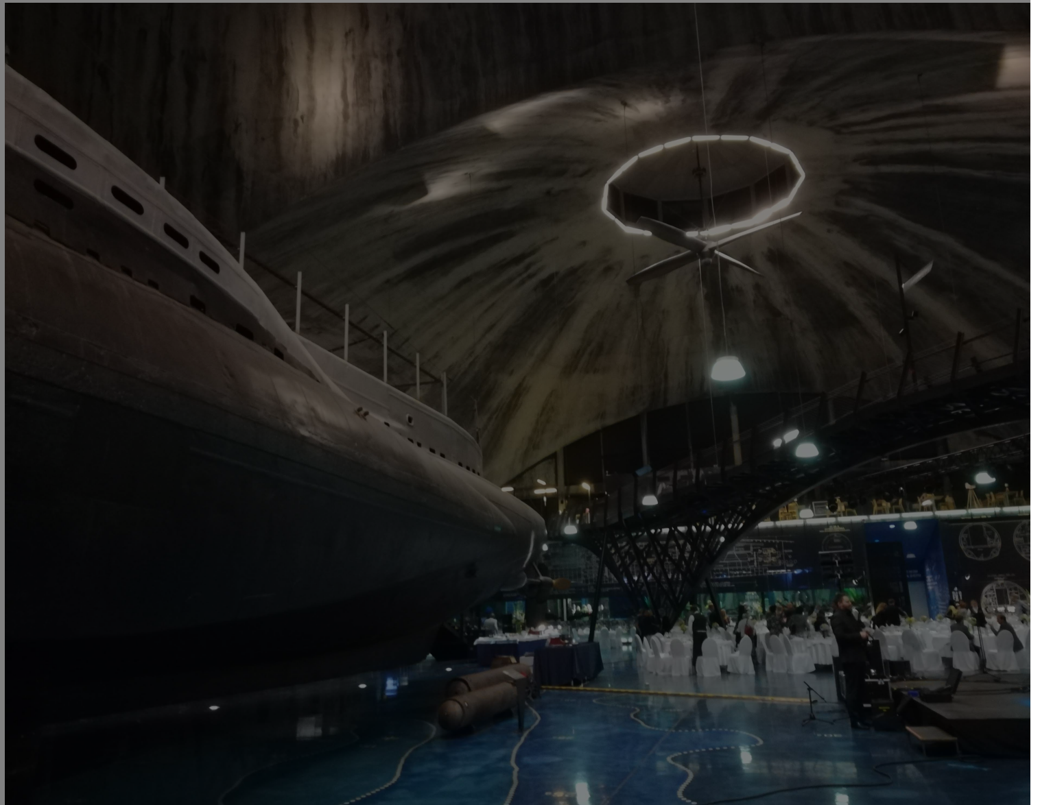
10 th ICCPR in University of Tallinn, Estonia

The fourth area of discussion was the multidimensional relationship of the creative industries and cultural policies, reflecting the mutual impact of new business models of creative entrepreneurship, industrialised creative processes and other emerging forces on cultural policies around the world