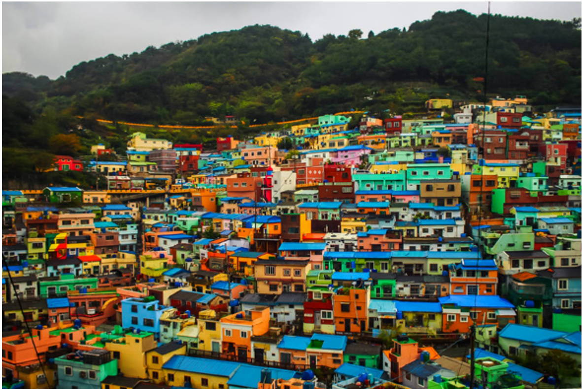
— Gentrification in Busan; Gamcheon Culture Village. Jeremy Yip , Gamcheon Culture Village , 2015