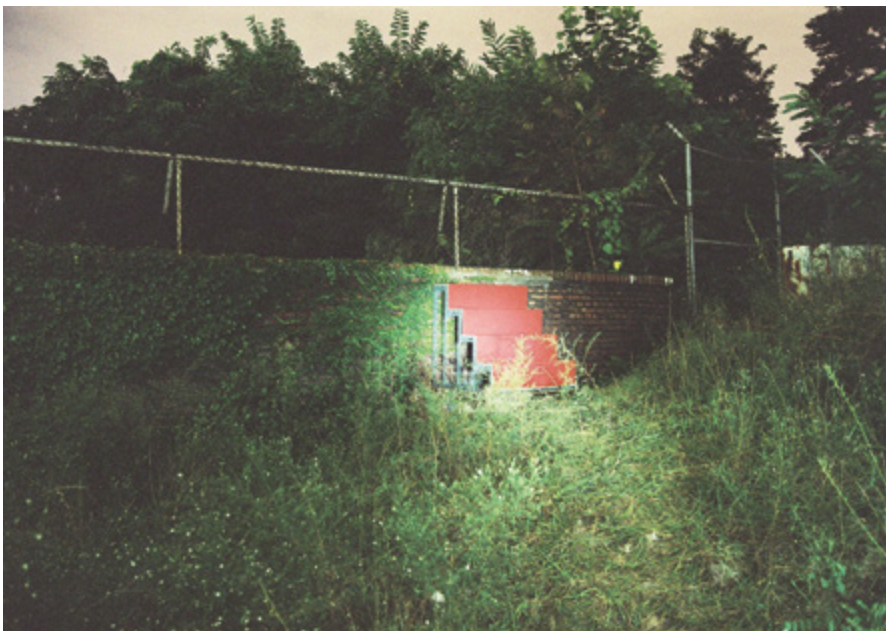
— When artist' collective Part Time Site couldn't find a suitable location to exhibit, they started exploring the public space.