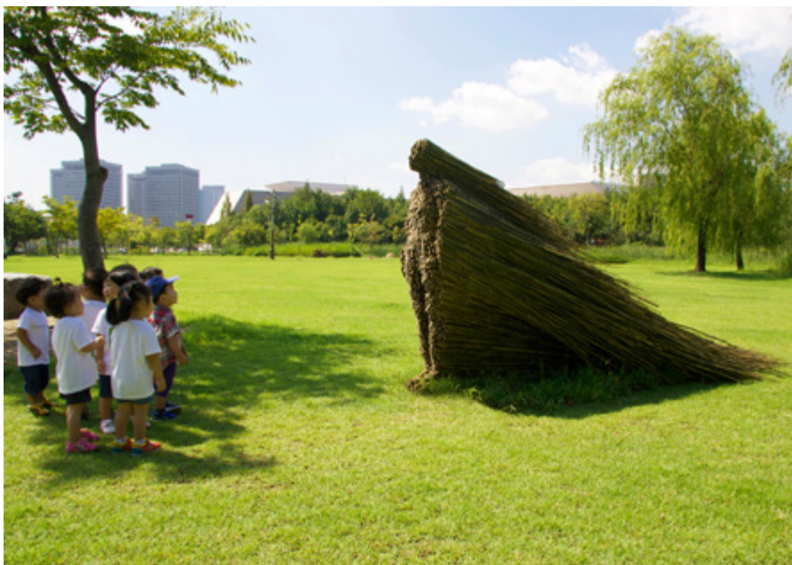
— ‘Nature-Art’ made by Olga Ziemska during a one month residency at YATOO International Artist in Residence program in Wongol, Korea, commissioned by Daejeon Museum of Art.