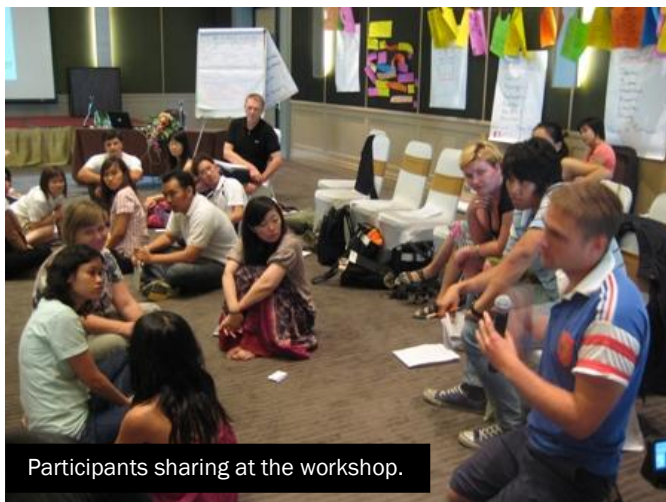
Participants sharing at the workshop.

Climate Leaders: Release your Creative Powers. How can art enhance our ability to think and act differently? was a capacity-building workshop for 30 young leaders from ASEM countries. The workshop encouraged the participants to develop climate change solutions for local communities with an emphasis on the role that culture and creativity can play in finding these solutions. A schedule was designed based on Linked Environments for Atmospheric Discovery's (LEAD) existing experience and previous involvement with the British Council's Climate Cool workshops run in 2007 and 2008. Over the six days the workshop incorporated a variety of formats that included group presentations, buddy groups, creativity workshop/theatre sessions, participant-led energiser sessions, "show time" sessions, sharing sessions and project clinics.