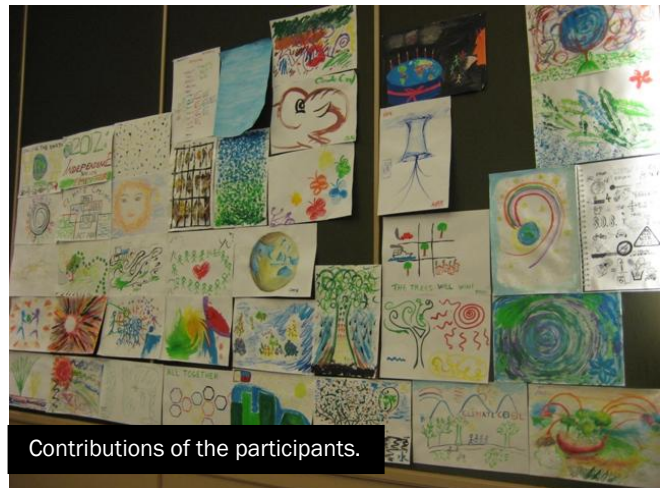
Contributions of the participants.

Climate Leaders: Release your Creative Powers. How can art enhance our ability to think and act differently? was a capacity-building workshop for 30 young leaders from ASEM countries. The workshop encouraged the participants to develop climate change solutions for local communities with an emphasis on the role that culture and creativity can play in finding these solutions. A schedule was designed based on Linked Environments for Atmospheric Discovery's (LEAD) existing experience and previous involvement with the British Council's Climate Cool workshops run in 2007 and 2008. Over the six days the workshop incorporated a variety of formats that included group presentations, buddy groups, creativity workshop/theatre sessions, participant-led energiser sessions, "show time" sessions, sharing sessions and project clinics.