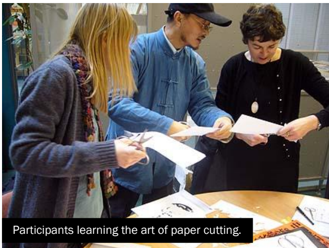
Participants learning the art of paper cutting.

Making Our Futures: The Art of Sustainable Living involved collaborative research between Manchester Metropolitan University (MMU) and the Central Academy of Fine Art (CAFA) that explored how artists can contribute to the work and lives of the city communities in Manchester and Beijing. The overall theme of the project was to tackle the issues surrounding contemporary lifestyle choices and the challenge of living more sustainably. It consisted of two workshops (in Beijing and Manchester) where the students of each institution engaged with the theme of sustainable living. The workshops debated issues such as urban waste management, sustainable design, community based carbonless future, folk art, contemporary technologies, global farming and climate change.