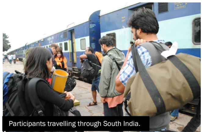
Participants travelling through South India.