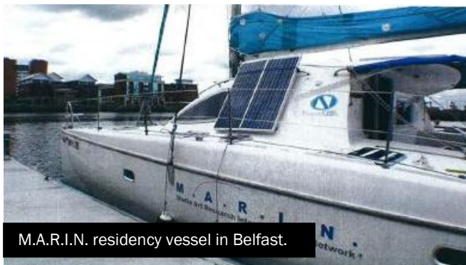
M.A.R.I.N. residency vessel in Belfast.