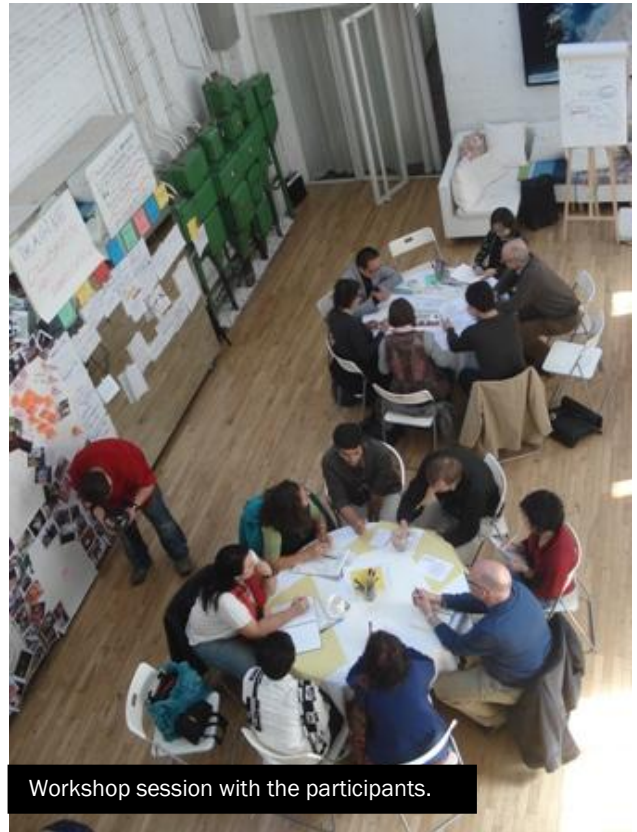
Workshop session with the participants.

Some key concerns raised during the Dialogue were surrounding the concept of climate change as an abstract idea: How do we translate factual information on climate