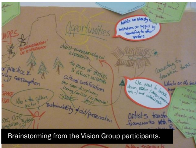
Brainstorming from the Vision Group participants.

The second year of the Connect2Culture programme brought together cultural experts from Asia and Europe for a symposium and a workshop that took place alongside the 15th Conference of Parties of the United Nations Framework Convention on Climate Change (Copenhagen, December 2009).