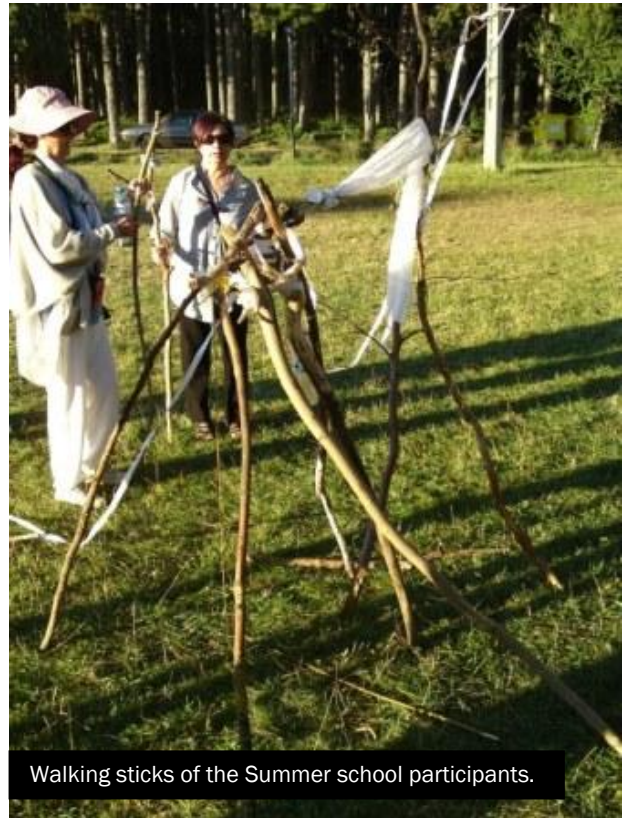
Walking sticks of the Summer school participants.

The First International Summer School of Arts and Sciences for Sustainability in Social Transformation brought together scholars, researchers, arts practitioners and local communities in order to address a range of environmental issues through dialogue and cooperation. Each day of the summer school featured at least half a day dedicated to the topic of walking. The other sessions were related to communities, arts and social