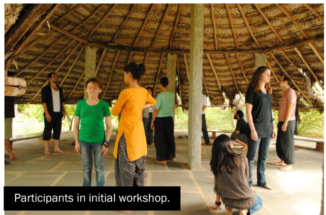
Participants in initial workshop.