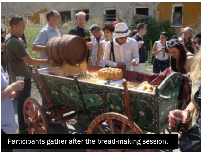
Participants gather after the bread-making session.

Article on culture360.org , “Walking for social and ecological transformation”