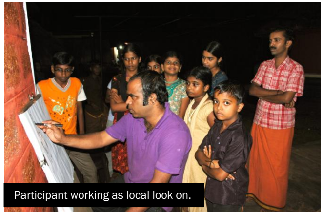
Participant working as local look on.

Article on culture360.org, “An experimental artistic journey through local communities of South India”