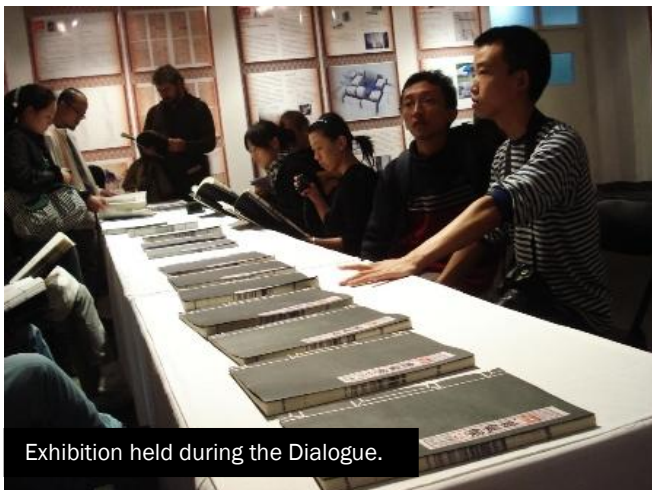
Exhibition held during the Dialogue.

The Dialogue on Arts, Culture and Climate Change was organised as part of the Asia-Europe activities along the 7 th Asia-Europe Meeting (ASEM) Summit of Heads of State and Government. 1 This project gathered together 45 artists, cultural practitioners, scientists and sociologists to discuss connections between culture, the arts and pressing global issues like climate change. The Dialogue was the first project initiated under the Connect2Culture programme.