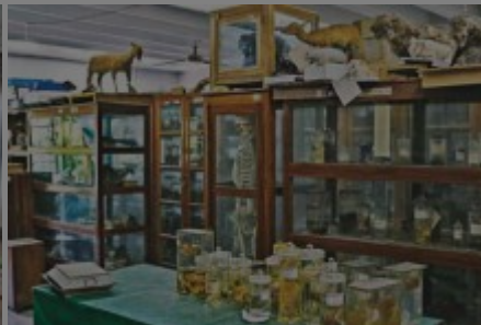
The Zoological Museum of the

University of Chittagong (ZMUC) is a natural history museum that is part of Zoology Department, University of Chittagong , Bangladesh. It was established by Zoology Department in 1973 as a teaching collection of zoological specimens and material for dissection. However, the museum has the prospect to be a vibrant natural history museum as it is in the Indo-Burma biodiversity zone, hosting a significant number of specimens from this area. The primary task of the Zoological Museum of the University of Chittagong is to collect and manage zoological specimens for scientific and study purposes . However, the museum is planning to be a more research-based museum the activities of which will include: