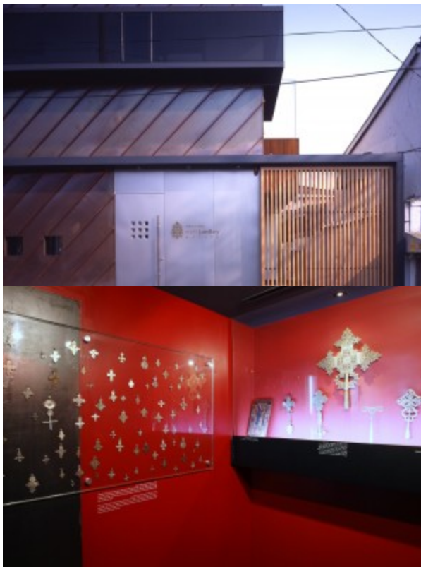
World Jewellery Museum, in

Seoul, Korea, was founded in 2004 by a diplomat's wife, whose jewellery collection embodies 40 years of travelling around the world. It is one of the world's first museums entirely devoted to jewellery. The museum also stands out as it houses international, historical and ethnically diverse pieces. It is situated in the heart of the North Village in Seoul where history and culture pulse with daily rhythms of contemporary life. Visitors can explore 5,000 pieces of traditional jewellery from Africa, Asia, Europe, Pacific, Americas and the Pre-Columbian gold artefacts that are presented in nine exhibition galleries such as, 'The Forest of Art Deco', 'The Garden of Jewels', and 'El Dorado'. The museum has earned its reputation as the jewel