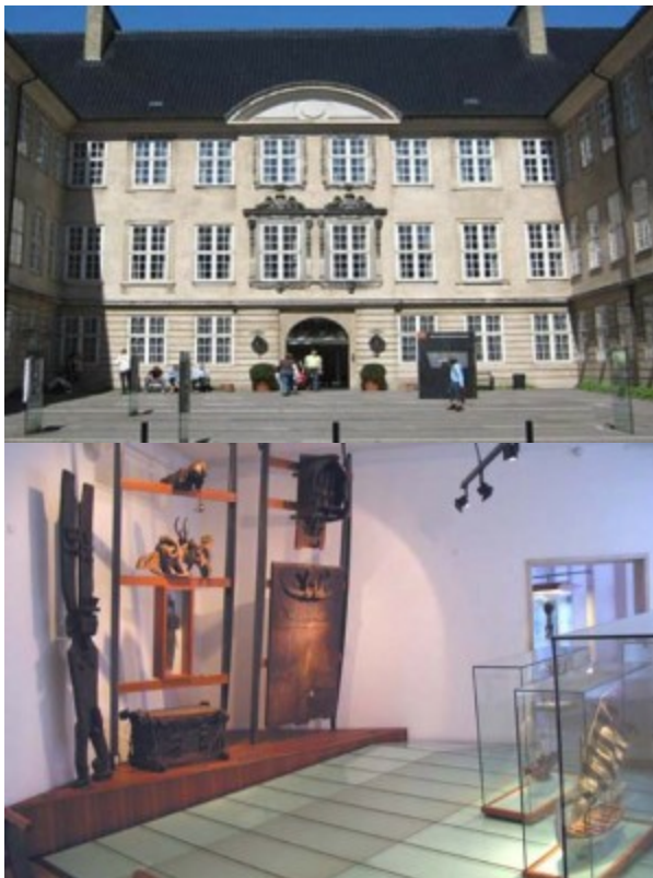
The National Museum of

Denmark is the largest museum of cultural history in Denmark. It covers Danish history, from prehistory until modern times. Besides the Danish collections, an important part of the museum is its ethnographic collection.