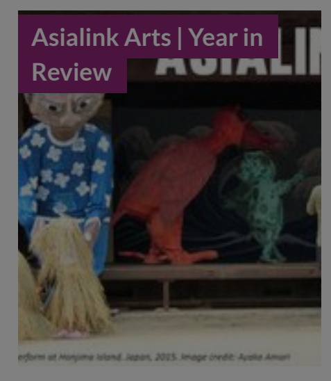
POSTED ON 15 MAY 2012