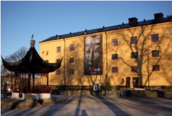
The Museum of Far Eastern

Antiquities ( Östasiatiska Museet ) situated in Skeppsholmen, Sweden, is housed in a renovated Navy supply store dating from the 18th century. It is a public museum founded in 1926 with one of Sweden's great archaeologist, Johan Gunnar Andersson (1874–1960) was its founding director. The contents of the museum was originally organised around Andersson's groundbreaking prehistory discoveries in China during the 1920s. The museum's collection today however includes diverse materials ranging from Asian archaeological objects to classical works of art. The strength of its collections is its Chinese Neolithic and bronze age artefacts. The museum also has a large research library dedicated to Asia, which is open to the public. Collection size: 100,000