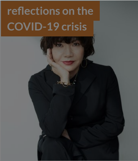
reflections on the COVID-19 crisis