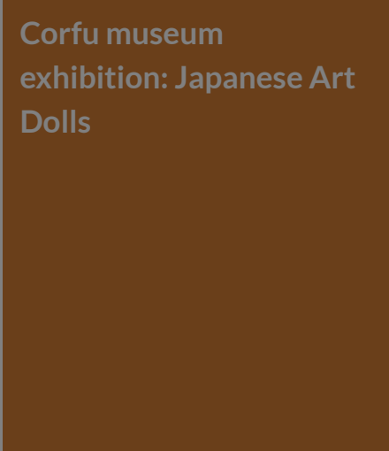
Corfu museum exhibition: Japanese Art Dolls