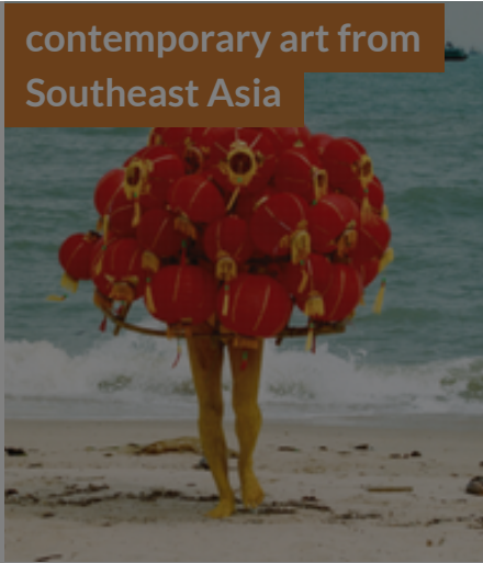
contemporary art from Southeast Asia