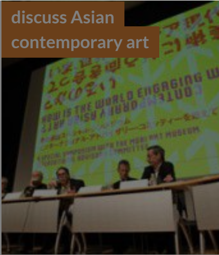
discuss Asian contemporary art