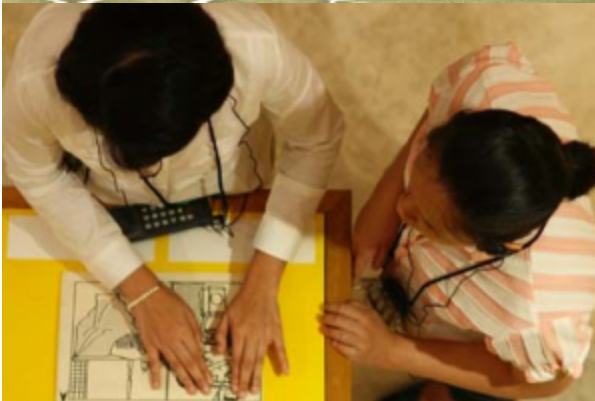
The Metropolitan Museum of

Manila is the first Philippine art institution to offer a bilingual, didactic program. It believes in the use of art as a tool in the teaching of excellence, cultural values, and social responsibility. The MET'S activities span a wide range. Philippine art exhibitions are curated from cultural institutions, private collections, and the Bangko Sentral ng Pilipinas Art Collection. Foreign art exhibitions are possible with the sponsorship of different cultural offices. In recognition of the value of scholarship, it maintains a strong relationship with the academic community. The MET