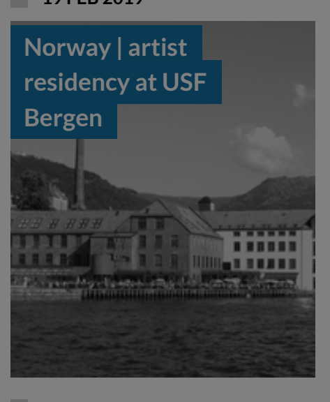
POSTED ON 19 FEB 2019