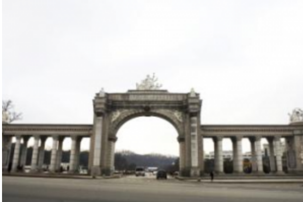
The Kyung Hee University

Hye Jung Museum is Korea's first and largest museum exclusively established for the collection and display of antique maps. The collection includes antique maps and atlases produced in the West from the 16th century to the 20th century, historical data related to antique maps, and documents not only covering Korea but also its neighboring countries. The Kyung Hee University Hye Jung Museum will continue to work to become the central research organisation for the study of history, geography, and culture of Korea, as well as neighboring countries, and provide an excellent