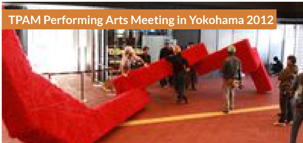
TPAM Performing Arts Meeting in Yokohama 2012