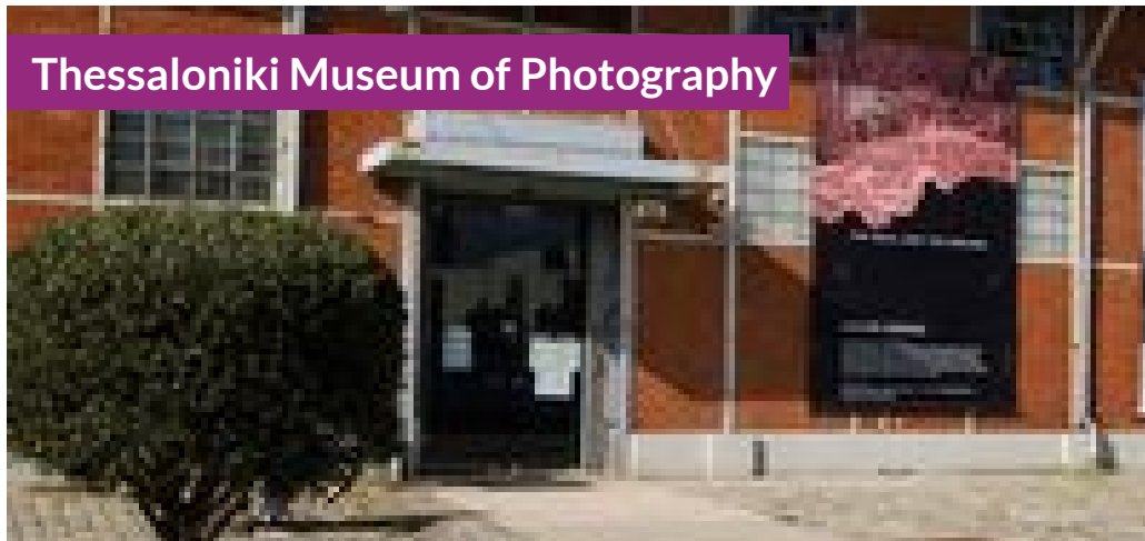
Thessaloniki Museum of Photography