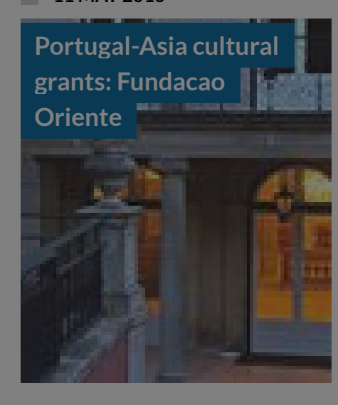
15 MAY 2018