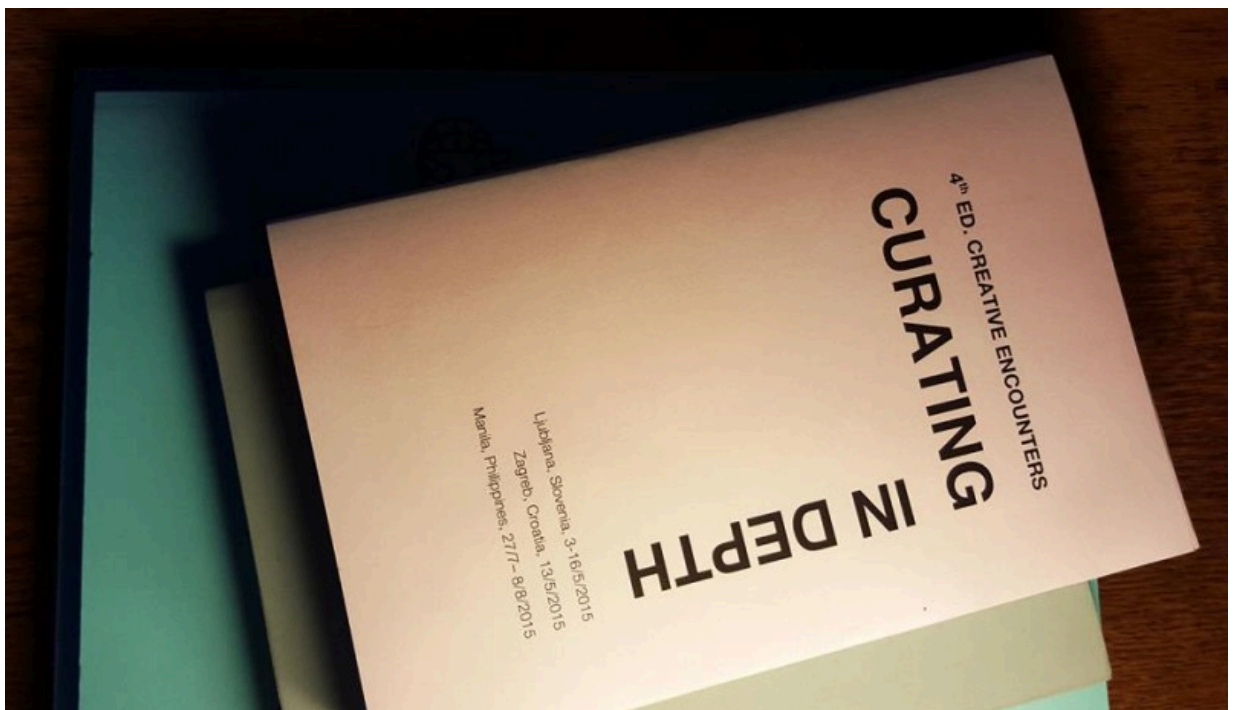
Curating-In-Depth toolkit [/caption]

Curating-In-Depth , organised by SCCA, Center for Contemporary Arts – Ljubljana (Slovenia) and Planting Rice (the Philippines) and associated organisation Kurziv (Croatia), was an incubation project between non-governmental institutions from Europe and Asia , whose goal was the development of curatorial education. It connected initiatives in the field of curatorial practices and the production of visual arts exhibitions, which share the same approach (we call it the curating-in-depth), but are rooted in different cultural environments and artistic milieus. The project was selected for support in 2015 through the 4th edition of Creative Encounters: Cultural Partnerships between Asia and Europe , launched by the Asia-Europe Foundation (ASEF) , and its partners the Arts Network Asia (ANA) and the European network Trans Europe Halles (TEH) .