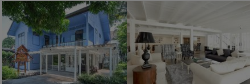
The Chiang Mai House of Photography

is a centre for collecting and preserving photography of northern Thailand as well as offering photographs of temple murals from the Lanna period in this area. Collection documentation, preservation and research follow international standards. The mission of the Chiang Mai House of Photography promotes learning and knowledge exchange in order to increase understanding of local heritage through visual communication, exhibition and activities with the community. Public access is open and free to all. The facilities include an exhibition gallery, collection management and storage space, meeting area and library with free wi-fi for study and other activities. The Chiang Mai House of Photography is a museum created by the Department of Media Arts and Design at the Faculty of Fine Arts, Chiang Mai University. It is associated with and located on the grounds of the Chiang Mai City Museum complex. Permanent collections: