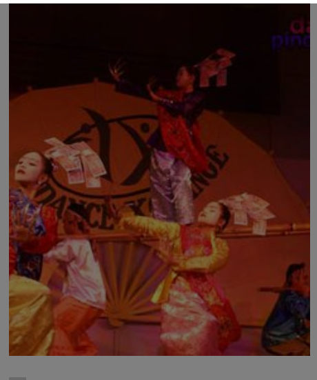
POSTED ON 08 MAY 2023