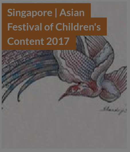
POSTED ON 18 MAY 2021