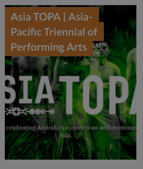
POSTED ON 15 MAY 2012