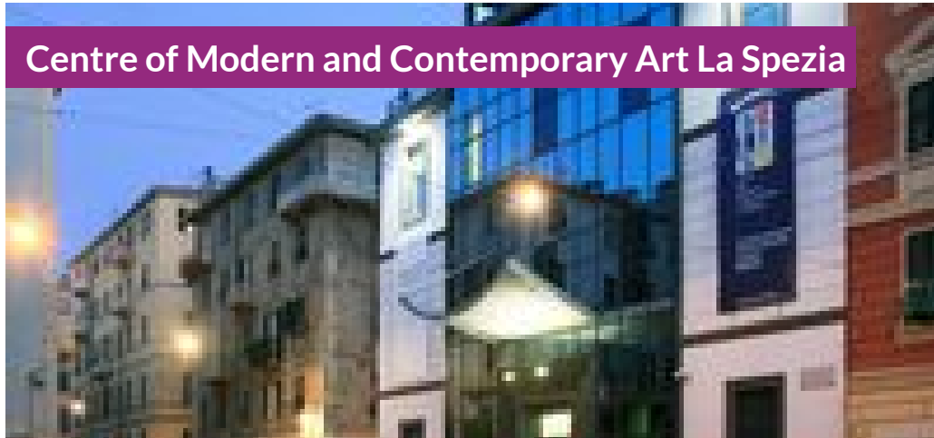
Centre of Modern and Contemporary Art La Spezia