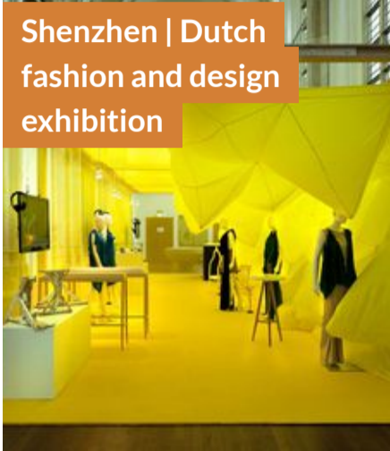
Shenzhen | Dutch fashion and design exhibition