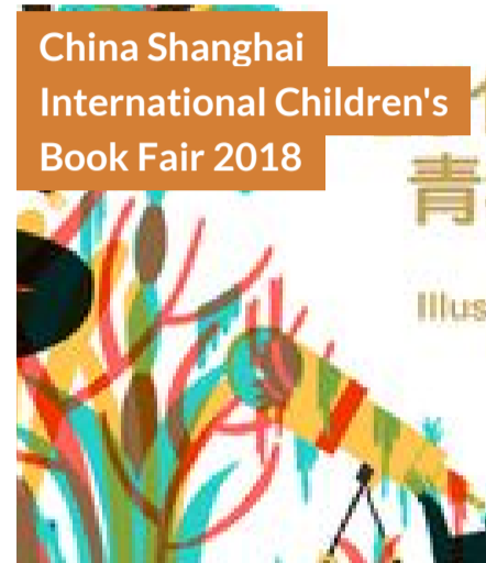
China Shanghai International Children's Book Fair 2018