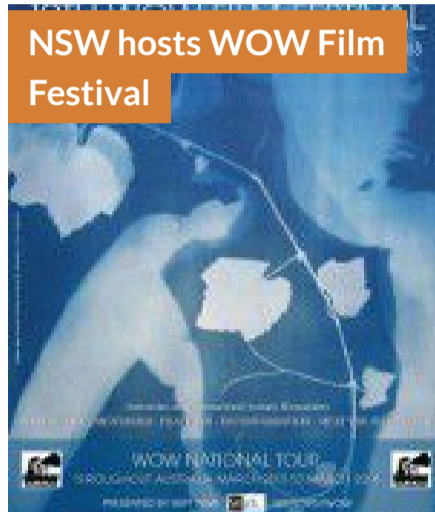
NSW hosts WOW Film Festival