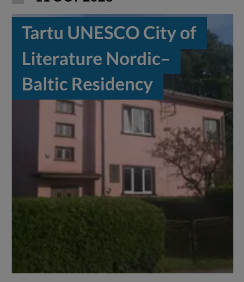
POSTED ON 17 MAR 2022