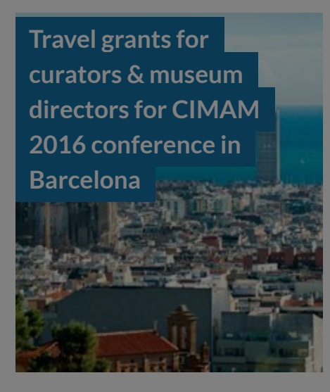
POSTED ON 07 JUN 2022