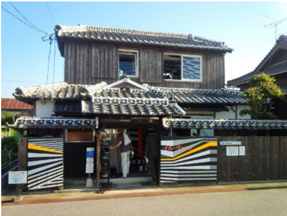
Setouchi Triennale 2016

You can read the master plan for Setouchi Triennale 2016