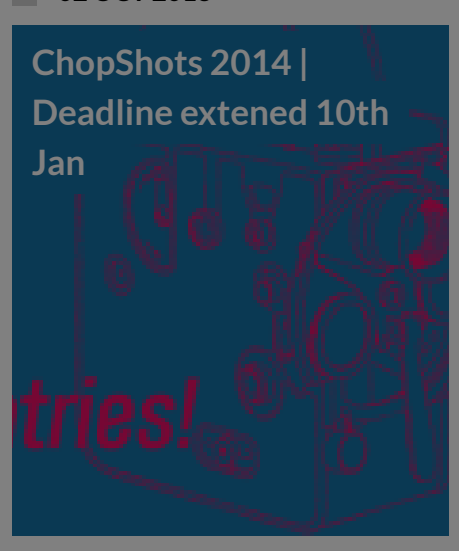
POSTED ON 02 OCT 2013