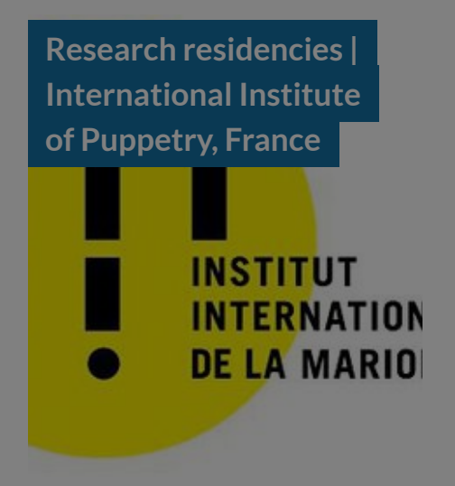
POSTED ON 05 MAY 2016