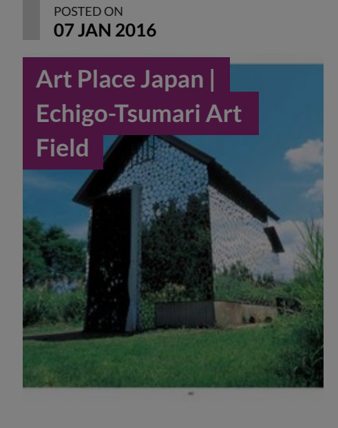
Echigo-Tsumari Art Triennale 2015