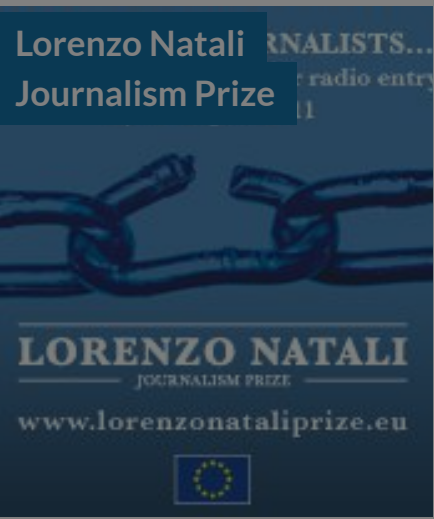
POSTED ON 24 MAY 2021