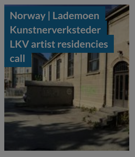
POSTED ON 23 AUG 2018