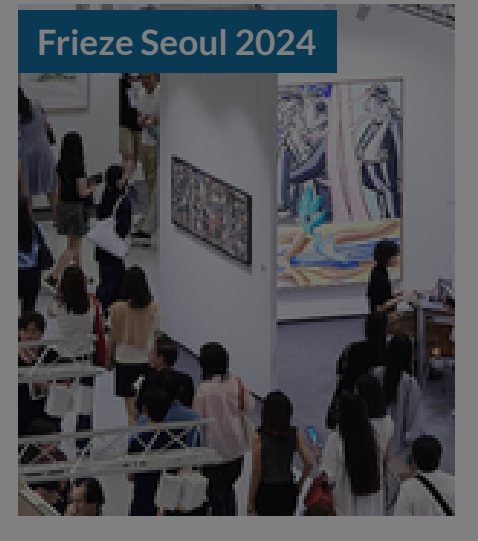
POSTED ON 06 SEP 2010