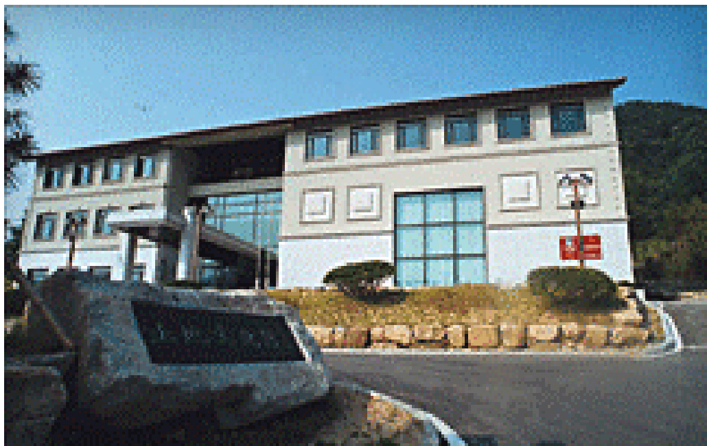
The National Arts Council of Singapore

and the Toji Cultural Foundation in South Korea are pleased to offer fully-paid 2013 residency awards to up to 3 Singapore writers from any of Singapore's four major languages, English, Chinese, Malay or Tamil.