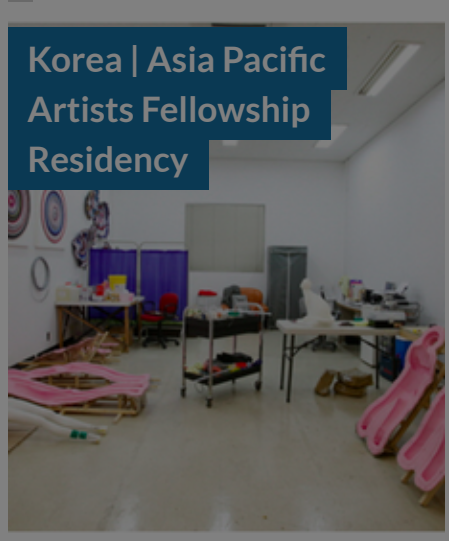
POSTED ON 23 NOV 2011

Gyeonggi Creation EONG Center Residency Studio Programme | 2012 Open Call for Artists and Curators