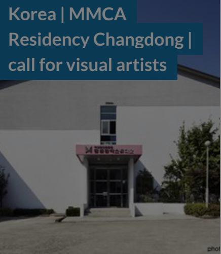
POSTED ON 07 SEP 2017