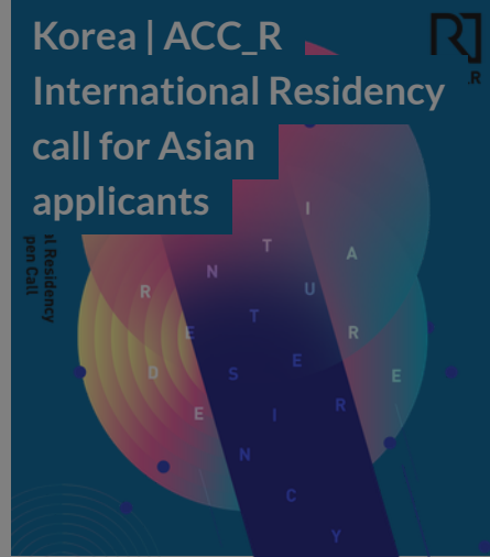
POSTED ON 11 MAR 2019