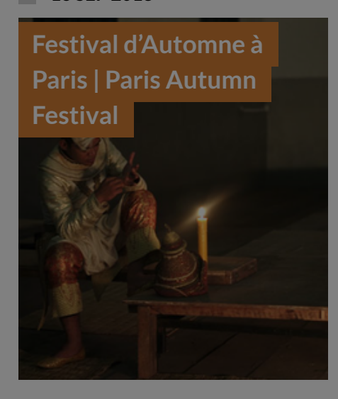
POSTED ON 01 JUN 2020