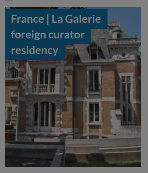
POSTED ON 16 MAY 2017