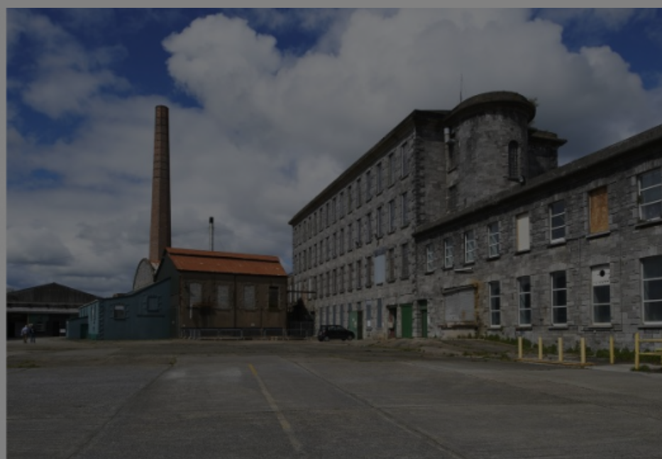
EVA International 2014 venue at the Kerry Group former Golden Vale Milk Plant.