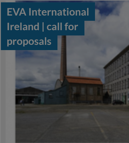
EVA International 2014 venue at the Kerry Group former Golden Vale

EVA International Ireland | call for proposals