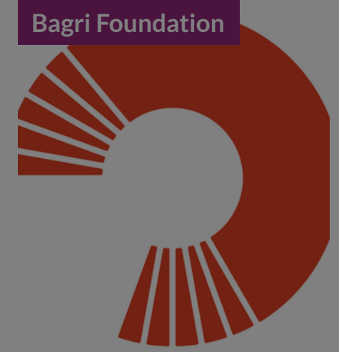
POSTED ON 22 MAR 2013