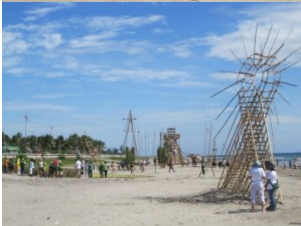
International arts and

environment festival in the Philippines calls for partners and artists for 4th BBIEAF in 2012, spreading the message of self-sufficiency, equitable development and better relationship with Nature.