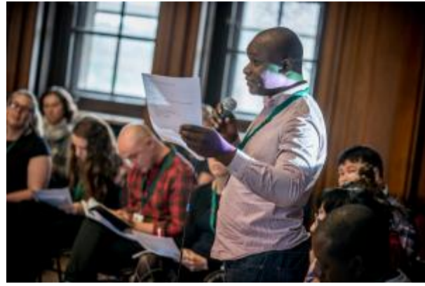
efa601417083080_DSC_6966 (small)

University and the ACC's Asian Arts Theatre. Ten renowned festival directors will guide 45 participants from the region and from all over the world through the 7-day training programme in this special context of a very ambitious and momentous art project in Korea.